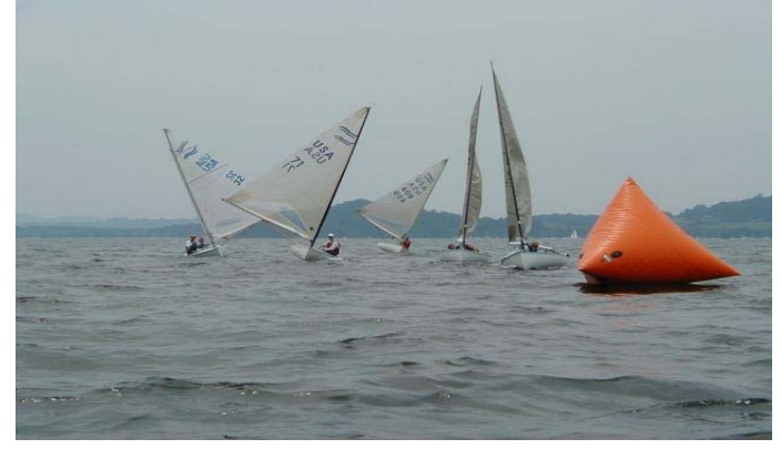
Action from the 2006 Finn Regatta