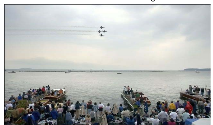
A Supersonic Fly-By As Seen from the BTV Waterfront