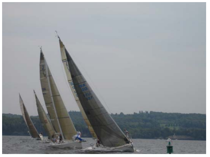
Action from the 2006 Odziozo Race

At times its been frustrating, but more often its been exhilarating. In addition to the regular Wednesday night and weekend racing, there have been social gatherings and even a spectacular air show put on by the Vermont Air National Guard. Many club members viewed the air show festivities by land, others by sea. Either way it was awesome! Here are some of the many views on a wonderful summer.